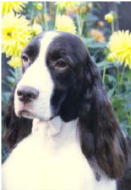
Ch. Marcur's Norwegian Wood, CD, CGC