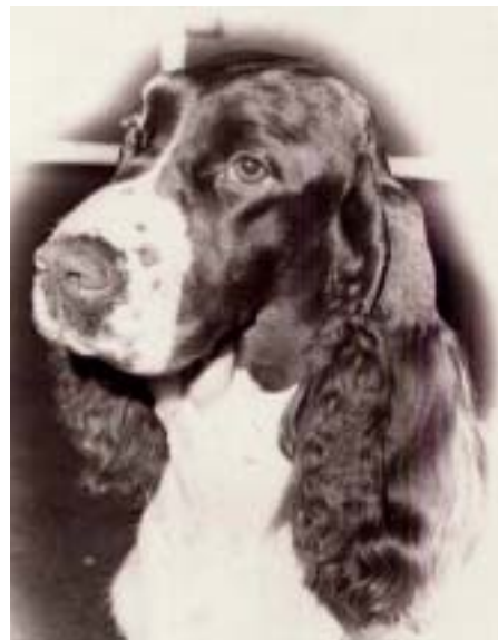
CH Lilley's Holiday Cheer, CDX

My advice to all of you with three or more "Yes's" is to sit back and smile, turn to the smiling person next to you and know that your life will always be filled with good friends and good dogs, and it will never be boring!